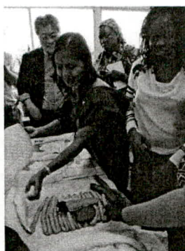
Health Education Material