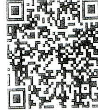
TIPP Scholarship Guideline, and Course Information

Copies to: Chief Secretaries , All Provincial Councils Leader of the House of the Parliament , The Parliament Leader of the Opposition , The Parliament Chief Government Whip , The Parliament Auditor General/ National Audit Office